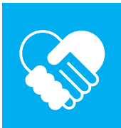
Community relations and engagement