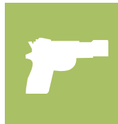
Use of firearms and Tasers