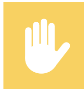
Stop and search