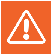
Critical and major incidents

IAGs have been vital in providing advice and guidance to the police in many areas, including: